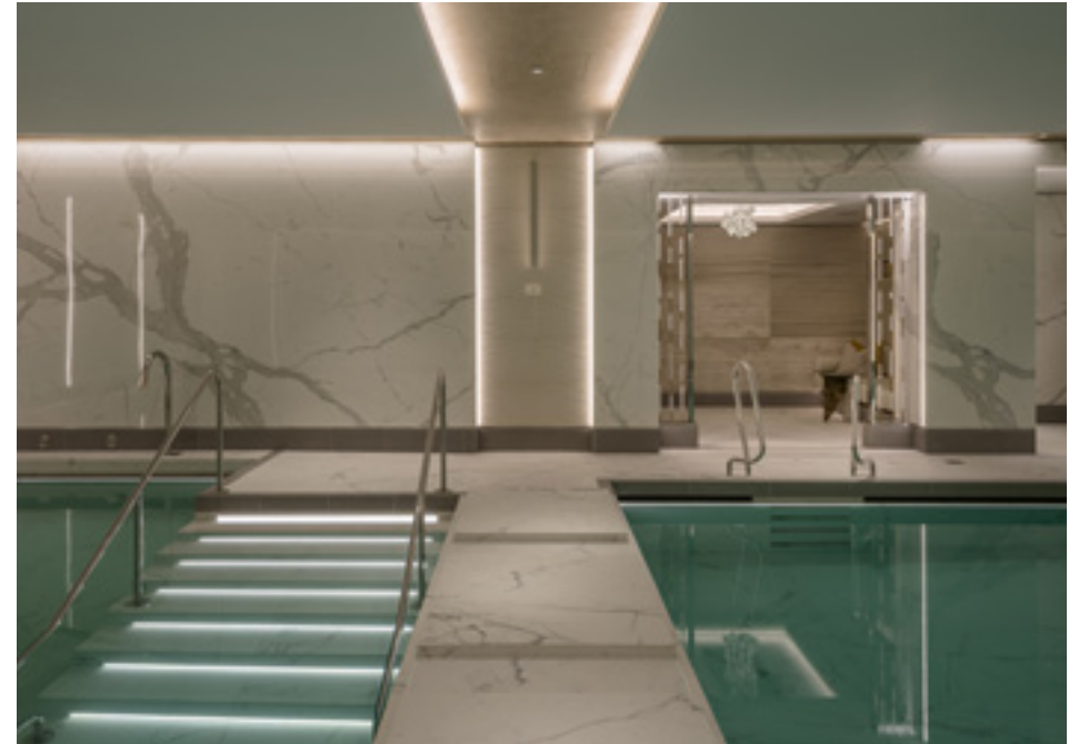
Southbank Place Health Club residents' swimming pool