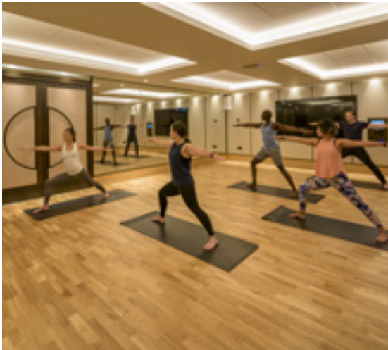
Southbank Place Health Club studio

Making Southbank Place your home brings with it access to the spectacular Health Club and Spa. From the visionary studio of Goddard Littlefair, and setting a new benchmark for luxury, this is aesthetic perfection in a wellness spa to rival all others. The ultra-lavish environment has been designed with sheer pleasure in mind. Relax the mind, strengthen the body and enjoy a sense of wellbeing without leaving Southbank Place.