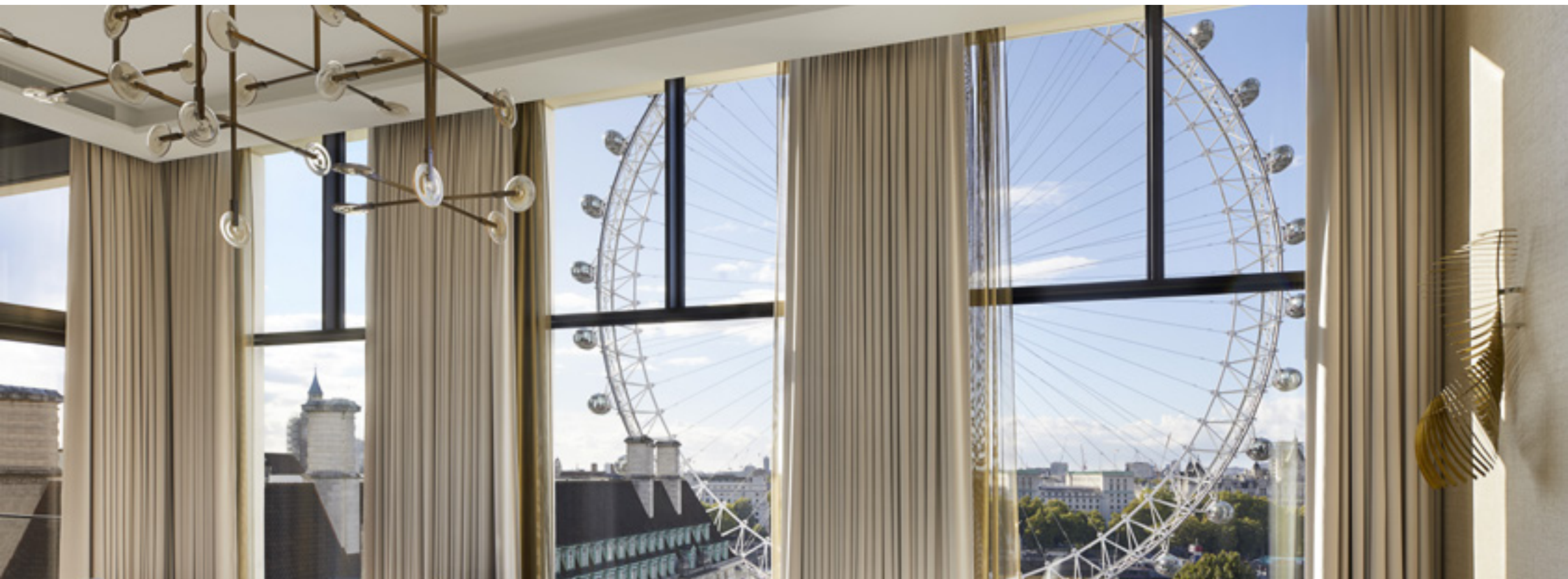
Actual view photography from apartment 1005