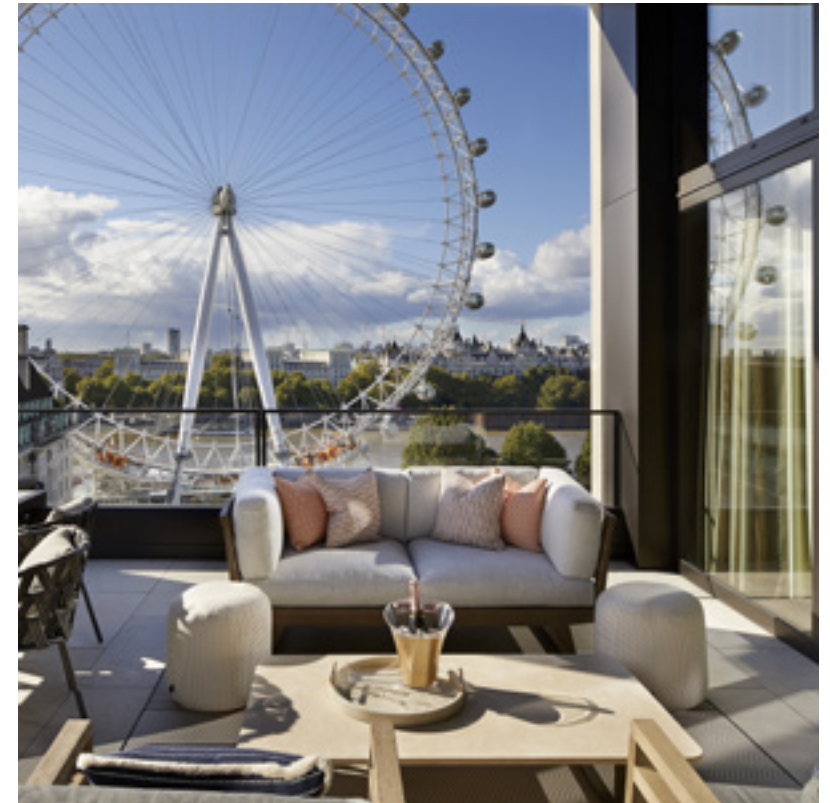
Photography of apartment 1005, Belvedere Gardens