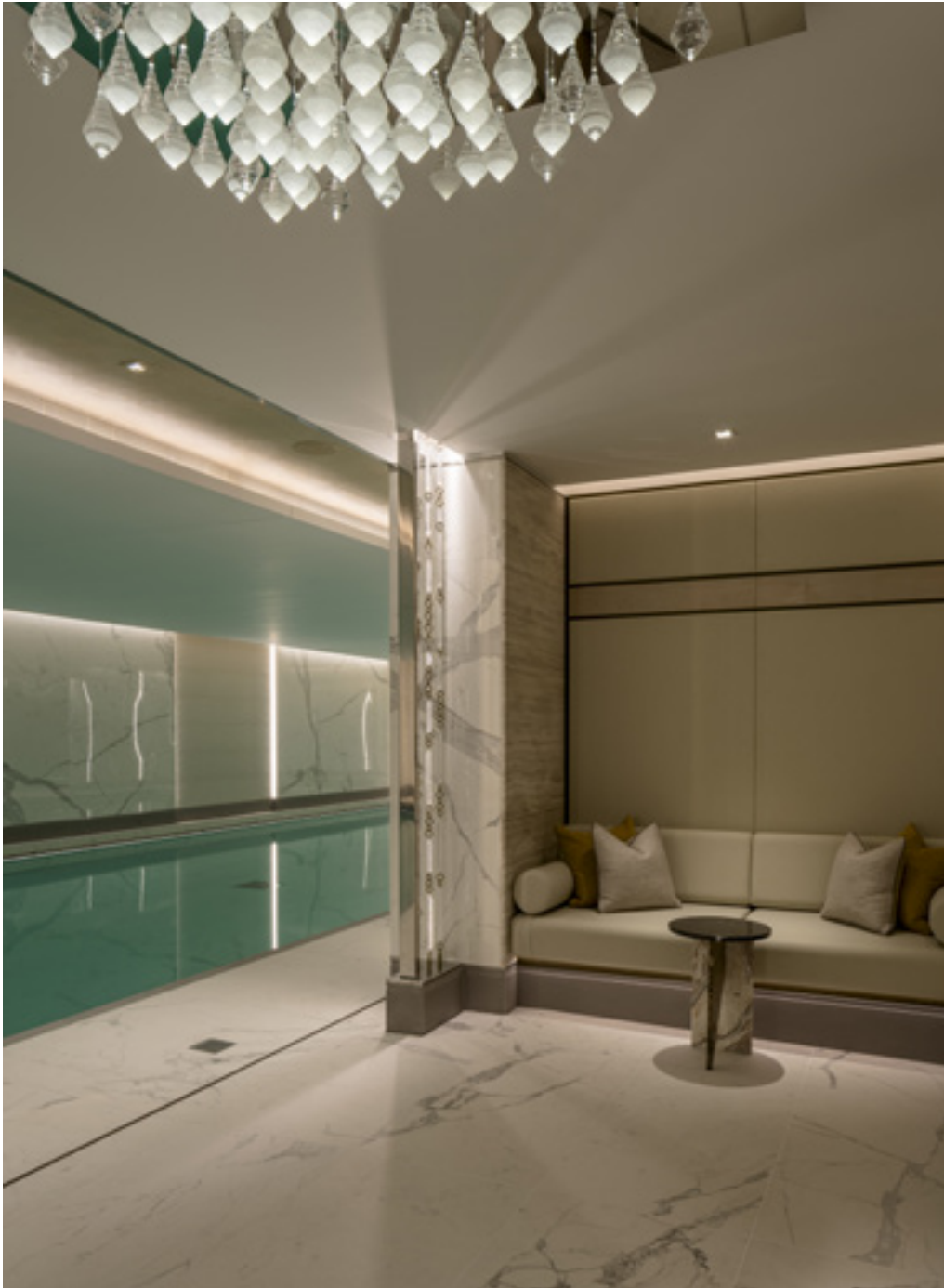
Southbank Place Health Club. Residents' 25m swimming pool